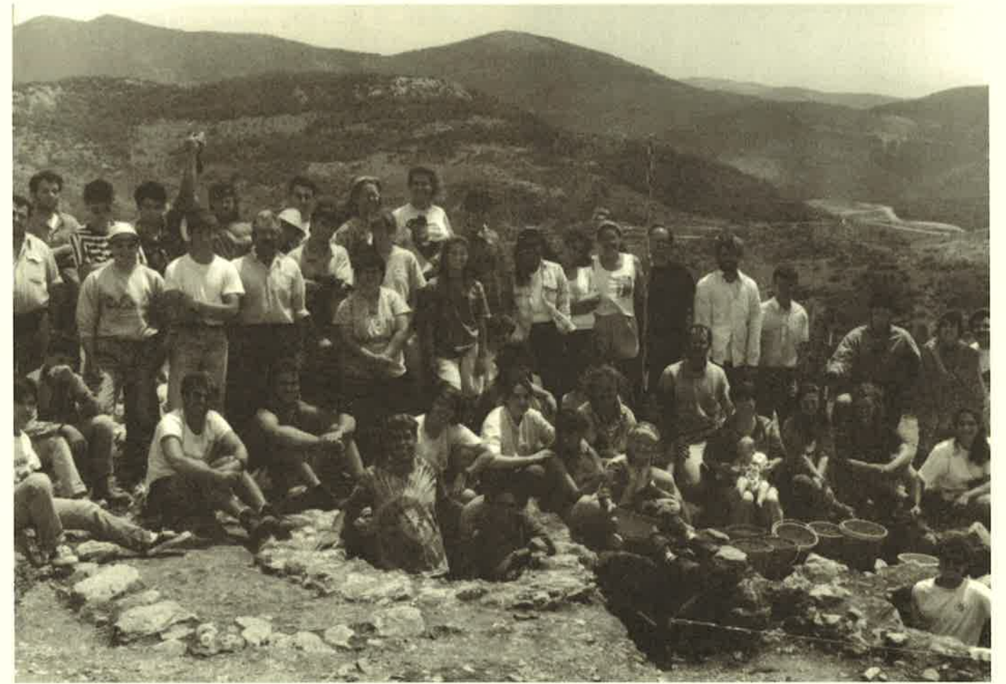
The Panakton crew, 1992.

disturbed. Evidently this was a family grave in which the earlier occupants were shoved aside to make room for succeeding burials. The second tomb seemed to be